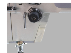
补针键功能：缝制更加精确方便 Sewing function: sewing more accurate and convenient