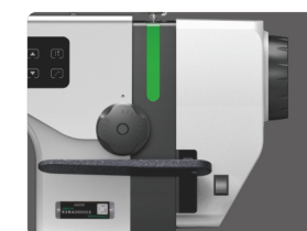
一体直驱技术，启动更迅速更节能 Direct drive all-in-one technology, start more quickly more energy saving.